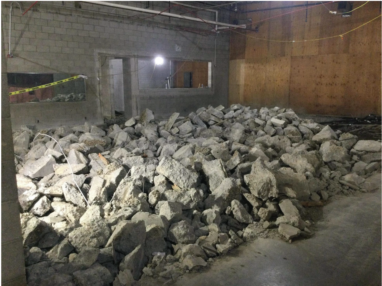
Ayala HS Locker Room Demo

Phase 4 of Modernization at Ayala HS has reached the halfway point with construction turning over the completed administration building as work gets underway in the locker rooms and gymnasium hallways. Though construction is not performing work in the main gymnasium, the project will impact every other room in the building. This includes electrical, data, and plumbing upgrades to the student store, underway with a completion date of August 2023. Work will take place in the administration, gymnasium, and pool buildings, as well as to the pool and pool deck. As with previous phases, this phase includes upgraded utility lines and security systems as well as new furniture and cabinetry, interactive technology, and ADA upgrades.